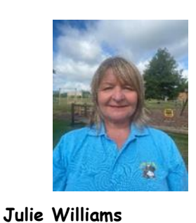
Afterschool care Practitioner